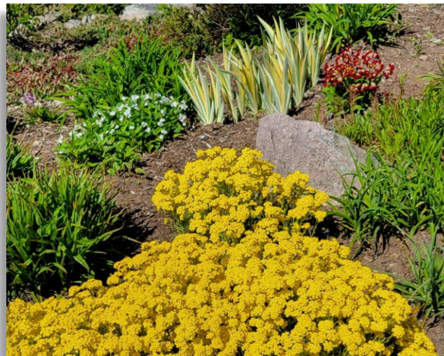
Spring 2023 at the Crossroads Garden

Occasionally we ask for submissions of your plant photos, so keep an eye out!